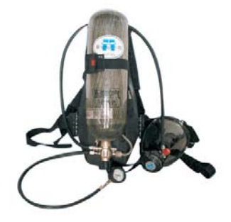
Self Contained Breathing Apparatus Cylinder : 6 ltr Capacity : 1800 ltr