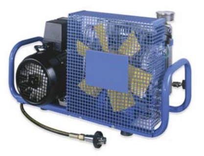
Breathing Air Compressors •1Φ 220V 60Hz – 300 Bar – 80 LPM •3Φ 440V 60Hz – 300 Bar – 100 LPM